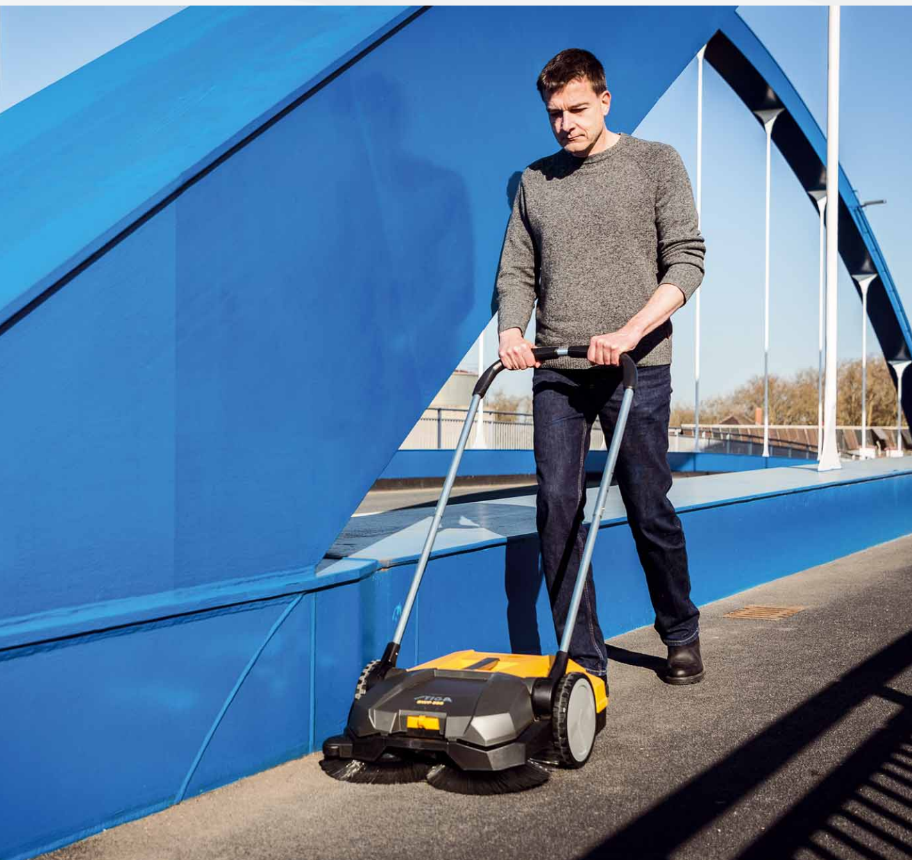
No limits: We also test on the highway bridge

REGISTRATION + SUBMISSION until 18.12.2020